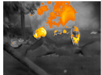
Graded Fire 1&2: The hottest things in the image are shown in a gradient of color while everything else is greyscale