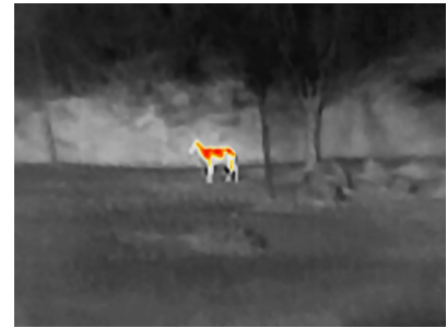
InstAlert: The hottest object in the image is colored while everything else is greyscale