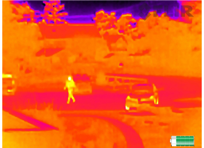
The FLIR Scout TKx helps you stay aware in the dark of night

The FLIR Scout TKx is a pocket-sized thermal vision monocular for exploring the outdoors at night and in lowlight conditions. This thermal monocular with an extended battery life reveals your surroundings, allowing you to clearly see people, objects, and animals from more than 90 meters (100 yards) away. The Scout TKx records thermal images or video in multiple color palettes that can enhance viewing, including InstAlert™—a greyscale palette that adds color to highlight the hottest object in the scene. Simple to use, the Scout TKx is the perfect companion, whether in the countryside or on your own property.